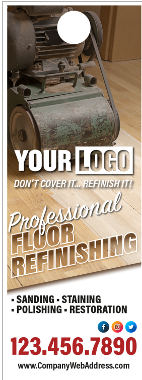
Template - B