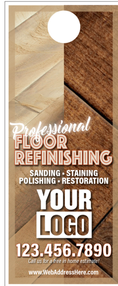
Template - C