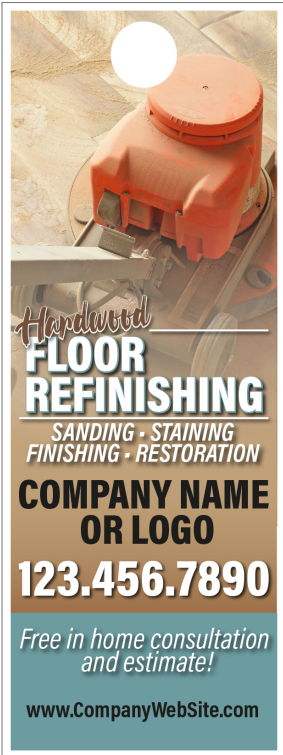
Template - A

14pt gloss cover with high-gloss ultraviolet (UV) coating to make colors more vibrant and protect your door hangers.